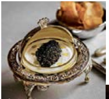
Caviar with potato chips and beer cream